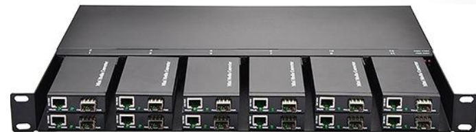
1 RU 19" Rack Mount Chassis Available