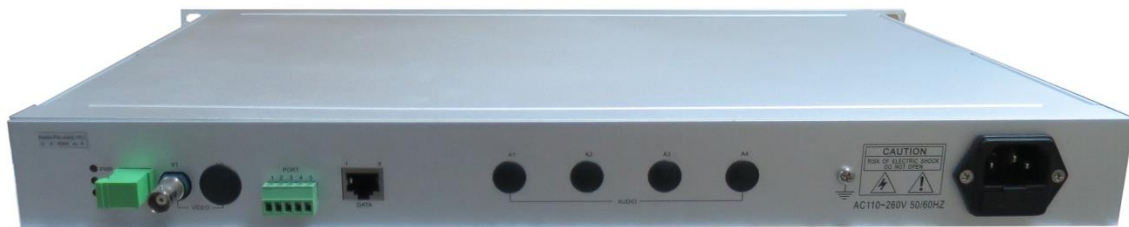
Example rear photo of MVX12 (1 video with 2 audio) shown