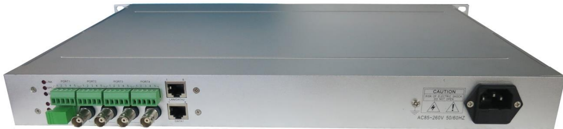
Example rear photo of MVX48 (4 video with 8 audio) shown